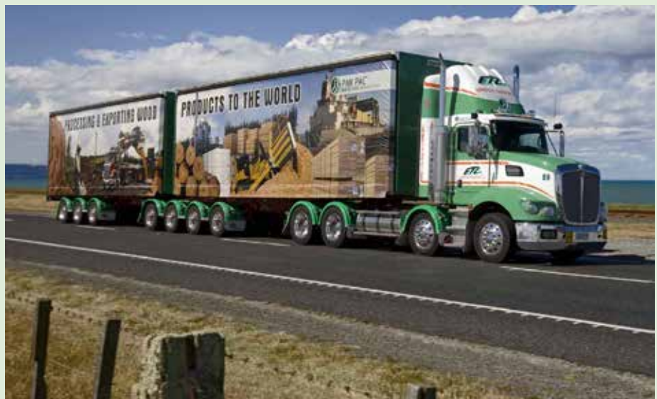
The FOA has successfully worked with Labour and National to bring high productivity vehicles onto our roads

The ETS aside, National has done many good things in its two terms since winning office in 2008. But it is the only major political party not to have released its forest policy for election 2014. We look forward to seeing it.