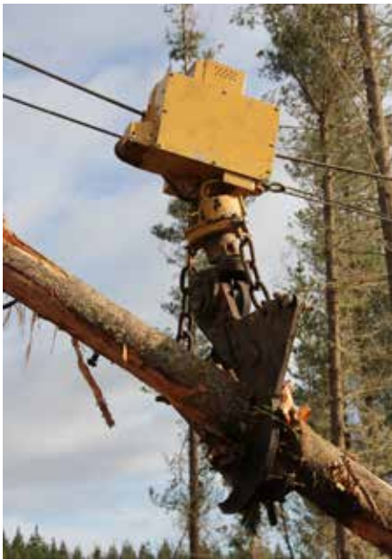
The new Alpine Grapple Carriage: Provides improved control under NZ conditions

The CutoverCam is the most recent work to be commercialised in this part of the programme. Marketers CutoverSystems Ltd, Rotorua, have already sold their first unit ( www.cutoversystems.com ).