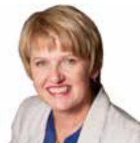
Forestry minister Jo Goodhew

A new Ministry of Primary Industries (MPI)-led workgroup is exploring planning tools that might deliver greater consistency, while building on previous work on a