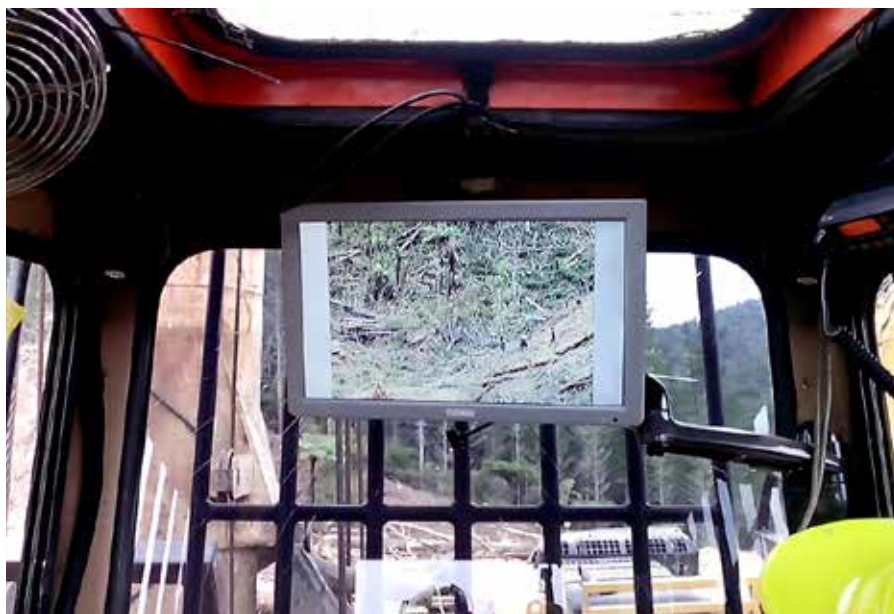
The CutoverCam and the view from the cab: Gives the operator with a clear view of the working area and the location of workers before and during a haul