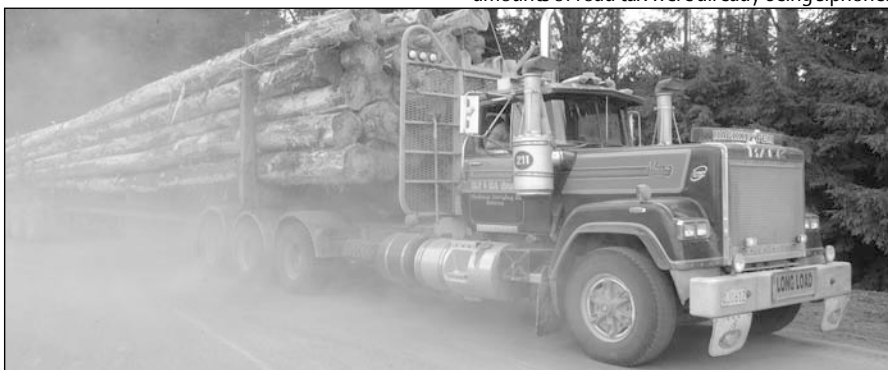
NZFOA is concerned road tax will continue to be siphoned off for non-roading purposes under proposed legislation

"If we do not address this issue directly, the regions requiring growth and new jobs will suffer. We hope the Government will seriously reconsider the Bill and make significant changes so the country can have safe and efficient roads."