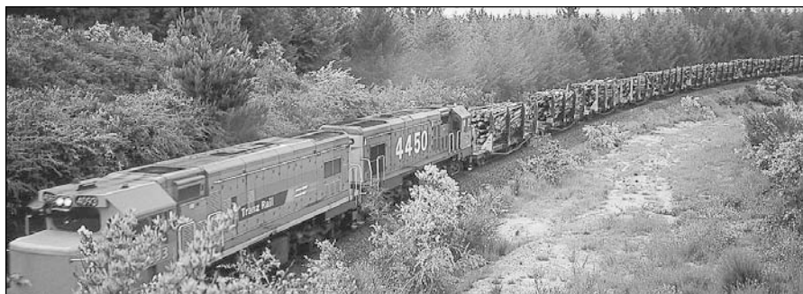
Fletcher Challenge Forests