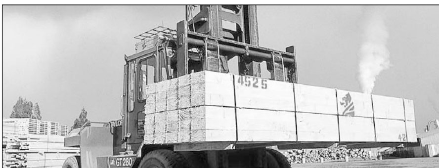
Fletcher Challenge Forests

"NZFIC has been working with the Building Industry Federation on a consumer information campaign which will be released soon. We will also co-operate with government agencies as they work through the implications of ERMA's report." ■