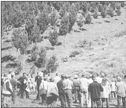
UNFF delegates get a close up look at New Zealand's plantation forests

International experts on forestry attended a subsidiary meeting of the United Nations Forum on Forests (UNFF) held in New Zealand in March to discuss the role of planted forests in sustainable forest management.