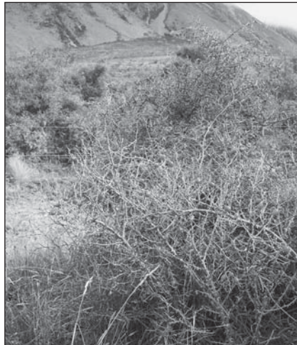
The government wants the Canterbury high country to revert to unproductive scrub, at the same time as ECAN is trying to discourage productive forestry

"Where is the incentive for irrigators to use water responsibly if the cost of maintaining water in the catchment falls on someone else? To the extent that upland forest owners are being used to address problems created by someone else, they are facing a loss not for the common good, but for the private benefit of others.