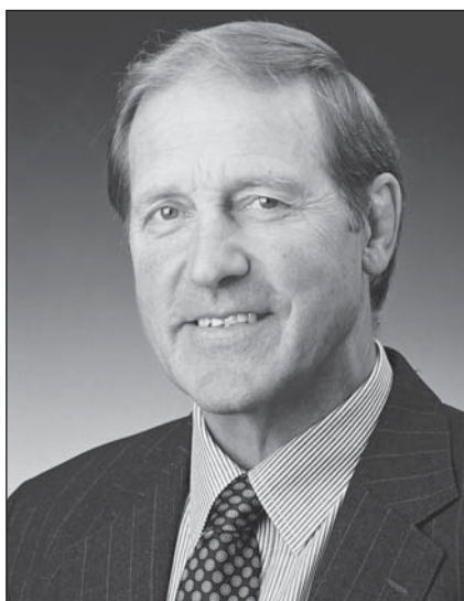
Peter Berg By controlling access, risks to visitors and forestry workers are minimised

"It would be a costly bureaucratic nightmare."