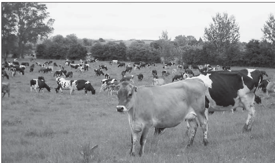
The government's Kyoto policy favours net emitters like farming at the expense of the industry which made the policy possible – forestry