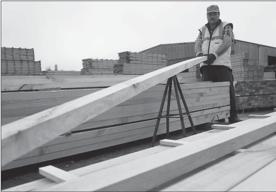
It comes from a sustainable forest Now it needs to carry the FSC logo and a statement which tells the sustainability story

More of New Zealand's export timber may soon carry a label saying it was grown in an environmentally friendly manner.