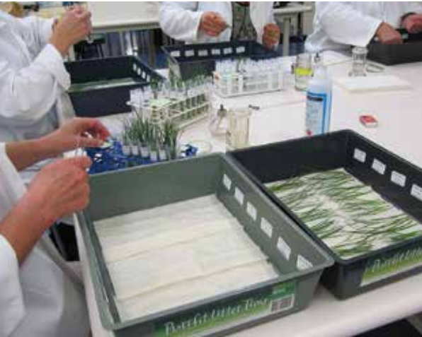
Laying out needles for a red needle cast susceptibility screening assay

MORE THAN HALF THE MONEY COLLECTED FROM THE FOREST LEVY IN 2015 IS BEING INVESTED IN RESEARCH, SCIENCE AND TECHNOLOGY.