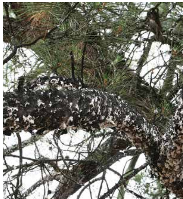
Giant pine scale on a pine in Crete This evil little sucker has now reached Australia and is a potential threat here

Is enough being done to prevent the import of unwanted micro-organisms? Of particular concern are Phytophthora ramorum (also known as sudden oak death and ramorum blight) and Fusarium circinatum , the fungus that causes a serious disease, pine pitch canker.